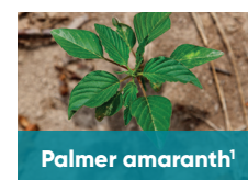
Palmer amaranth 1